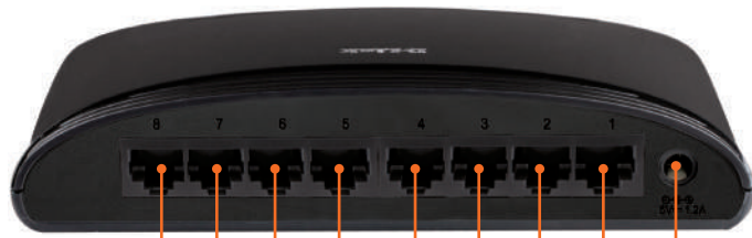
8 RJ-45 10/100 BASE-TX PORTS Connects to computers, print servers, or network storage