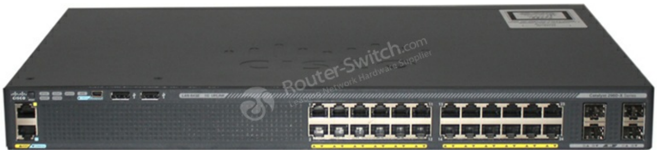
Table 1 shows the Quick Spec of the Cisco 2960X-24TS-L switch.

Figure 1 shows the front view of the Cisco 2960X-24TS-L switch.