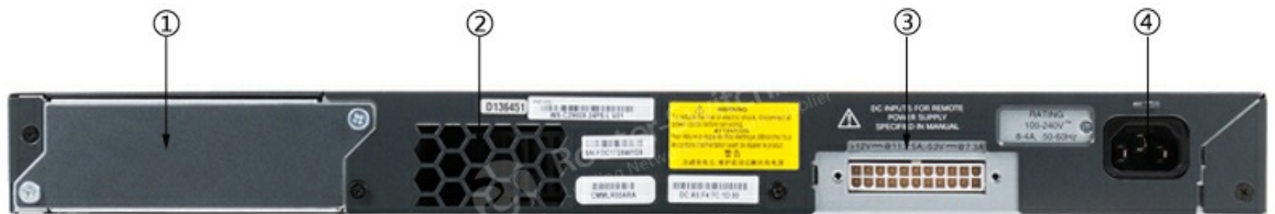
Figure 3 shows the back panel of the Cisco 2960X-24TS-L switch.

The Switch LEDs include SYST, STAT, SPEED, RPS, MAST, and STACK LEDs.