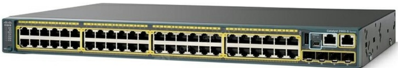
Table 1 shows the Quick Spec of the WS-C2960S-48TS-S.

Figure 1 shows the appearance of the WS-C2960S-48TS-S.